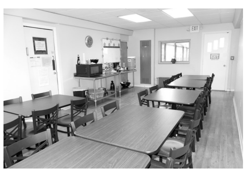
Dining Room: Updates In Progress